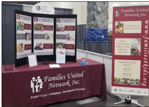
Recruitment of new families at an expo.

Our agency continues to expand across the state of Pennsylvania as we are located in Muncy, Scranton, Mount Joy, Mechanicsburg, Pittsburgh, Harrisburg, and Erie. In the past year, our North Central office, located in Muncy, has experienced the most growth, increasing the number of clients served by 30%! Due to this tremendous growth, the agency will be taking a look at options in the upcoming year for possibly expanding the office by adding an additional location. Our South Central office, located in Mechanicsburg has also experienced growth, particularly with kinship cases. In the past year, our workers have taken on the role of completing more emergency caretaker approvals when requested, which requires immediate case management and the licensing of the resource home within a 60 day timeframe.